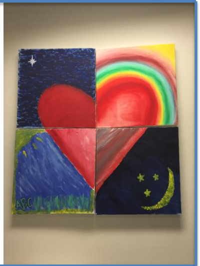
(Right) In one of ABC's team building exercises, the teachers were asked to paint how they feel about their work for the children. This Heart painting is what they painted.

Are there specific programs your team has implemented that have really impressed you? The REAL program I mentioned earlier is really impressive. This is unique to ABC Center. Children are systematically moving across different people, environment and stimuli. Children in our care have an easier time generalizing their skills especially when they are in a different environment (at home, at school, in the community). We want our children to apply everything they learn at ABC to wherever they go as quickly and effectively as possible.