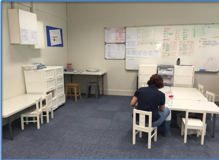
(Left) One of ABC's therapists quietly preparing for the day's lessons.

Many parents also tell me that beyond the way we do ABA, the love and dedication they feel our teachers have for their kids also really sets us apart.